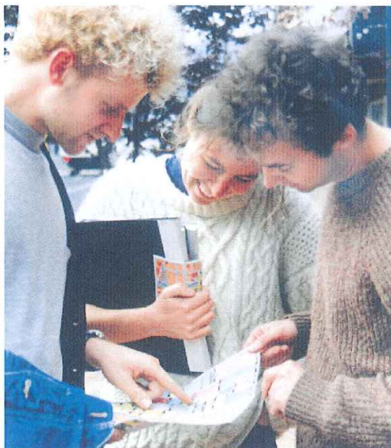
Happy young people are about to flood into Dunedin

It is very important that South Dunedin businesses advertise so they don't miss out on the opportunity.